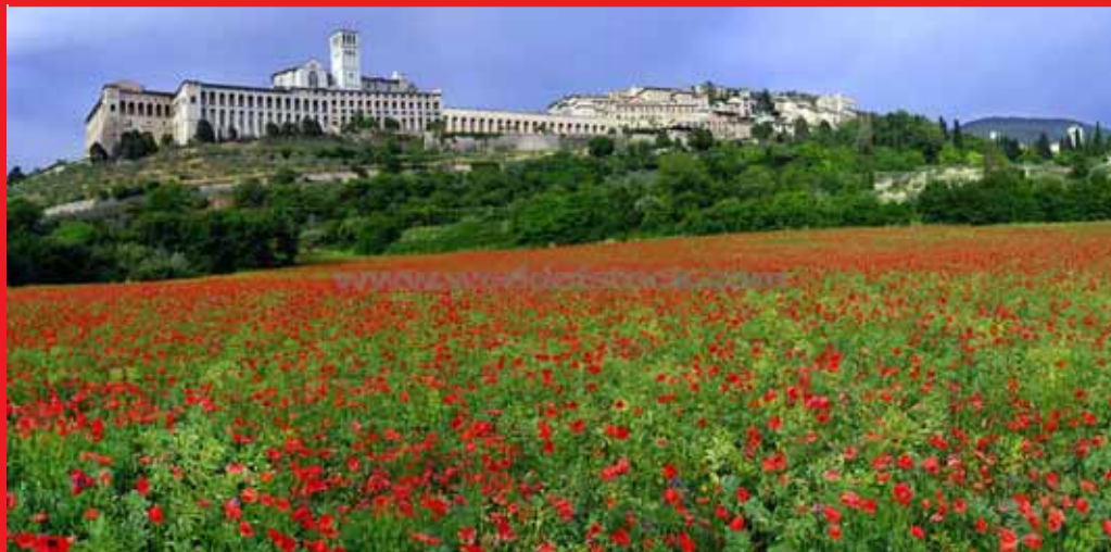
Assisi in Springtime: The Basilica of St. Francis above a field of poppies

ST. BONAVENTURE SECULAR FRANCISCANS ✠ DETROIT, MICHIGAN