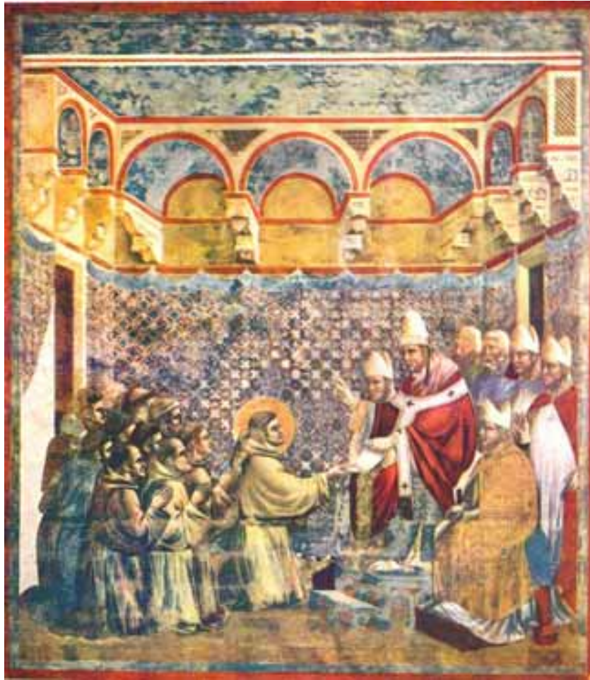
“Pope Innocent III Approving the Rule” by Giotto di Bondone, 1295, from the predella panel from St. Francis Receiving the Stigmata Louvre, Paris