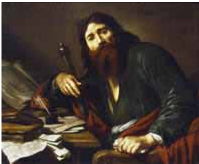
"St. Paul" by Claude Vignon