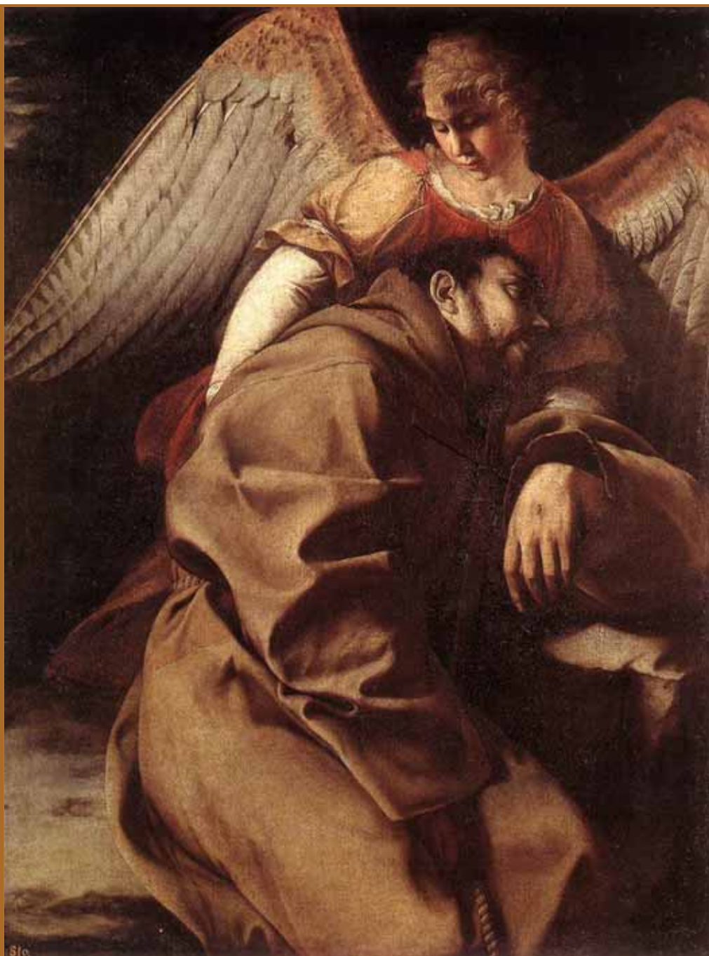
Orazio Gentileschi, St. Francis Supported by an Angel , c. 1603 Oil on canvas, 126 x 98 cm, Museo del Prado, Madrid

ST. BONAVENTURE SECULAR FRANCISCANS ✦ DETROIT, MICHIGAN