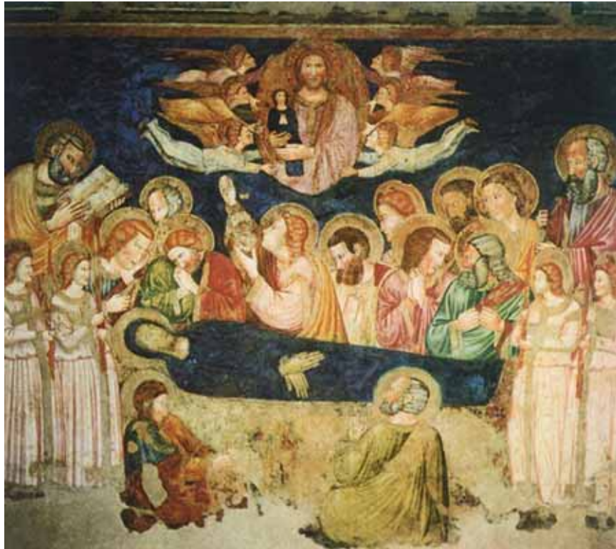
“Dormition of the Virgin” 13th century fresco of the School of Giotto in the church of Santa Maria dei Penitenti in Piove di Sacco, Padua (Italy)

St. Bonaventure Secular Franciscan Fraternity 1780 Mt. Elliott St. Detroit, Michigan 48207