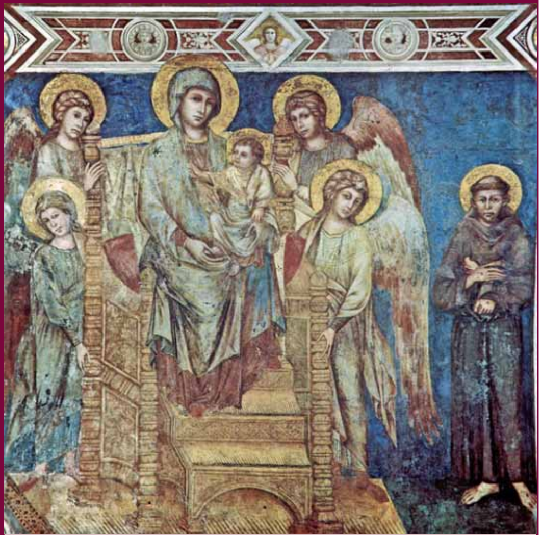
Cimabue's St. Francis Lower Basilica of St. Francis, Assisi

ST. BONAVENTURE SECULAR FRANCISCANS ✦ DETROIT, MICHIGAN